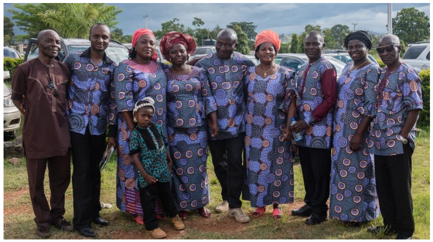
Workers with their Specially Designed Uniform for the Occasion