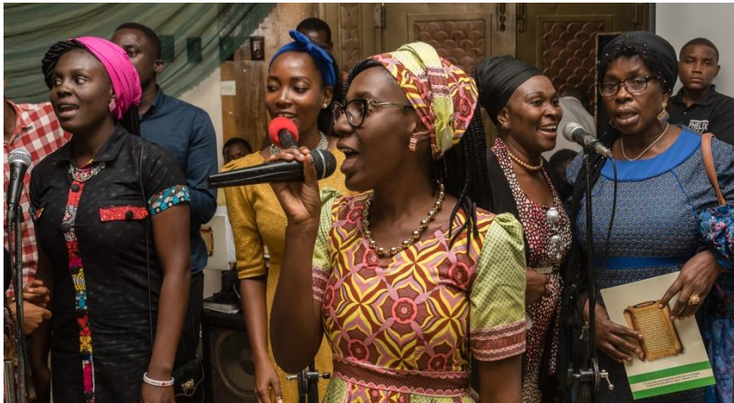
JETS ECWA Church Band