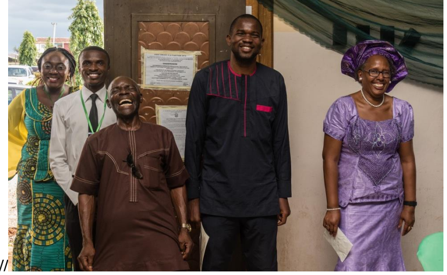
I guess I did make them laugh.