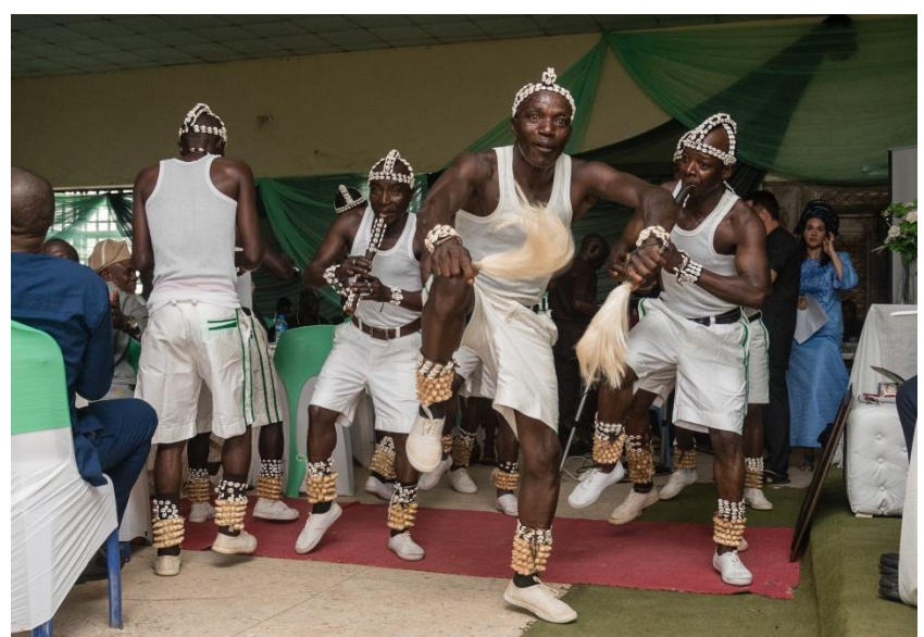
The Anaguta Dancers