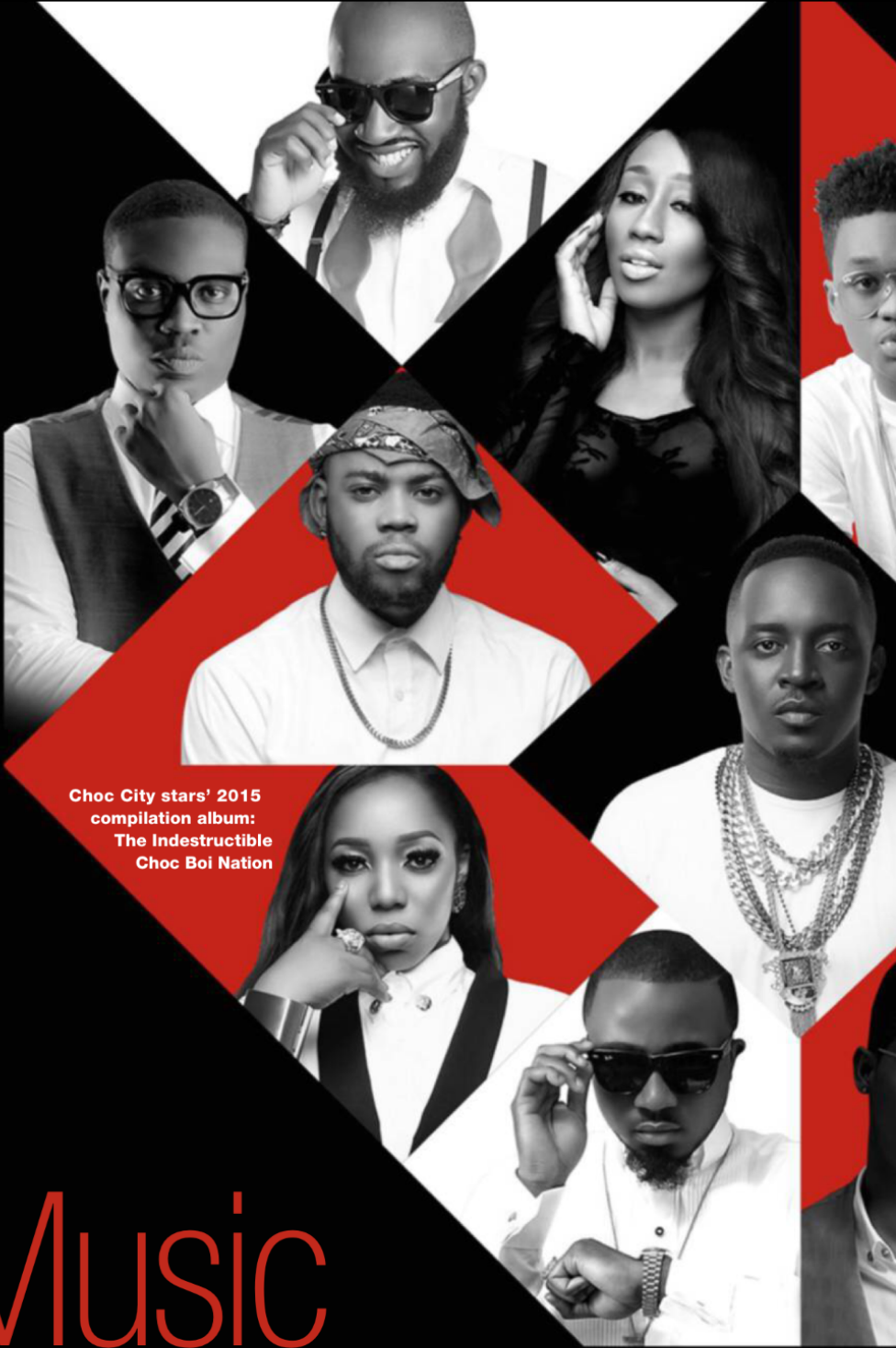
Choc City stars' 2015 compilation album: The Indestructible Choc Boi Nation