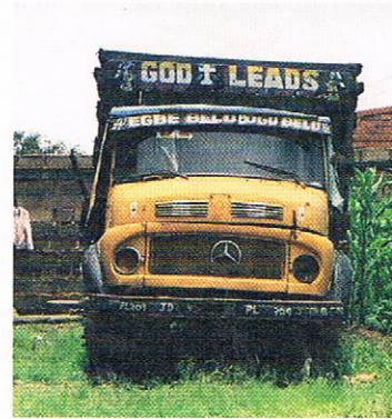
▲ Nigeria is so Christianized that even broken down trucks proclaim the gospel.

So mission supporters in the West need to get used to the idea of mundane missionary settings and activities. After all, the most likely mission field of the next century will be our own neighborhoods.