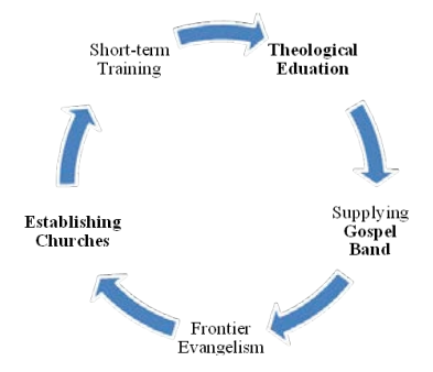
Diagram 1: The WOL Missional Cycle

How each constituent part relates to and interacts with the other parts causes change and produces growth. First, established churches support the ministry of the Gospel Band and theological education, through prayer and financial resources, and select and supply trainees for theological education. The churches also works with the Gospel Band to provide care, discipleship and training for their members. Second, some graduates from TE become pastors of local house churches; others join the Gospel Band and become itinerant evangelists. Third, the Gospel Band enjoys a continuous supply of graduates from theological education, whom it commissions for frontier evangelism. The three constituent parts of the movement work closely together, spinning the cycle outward, in national and even global evangelization.