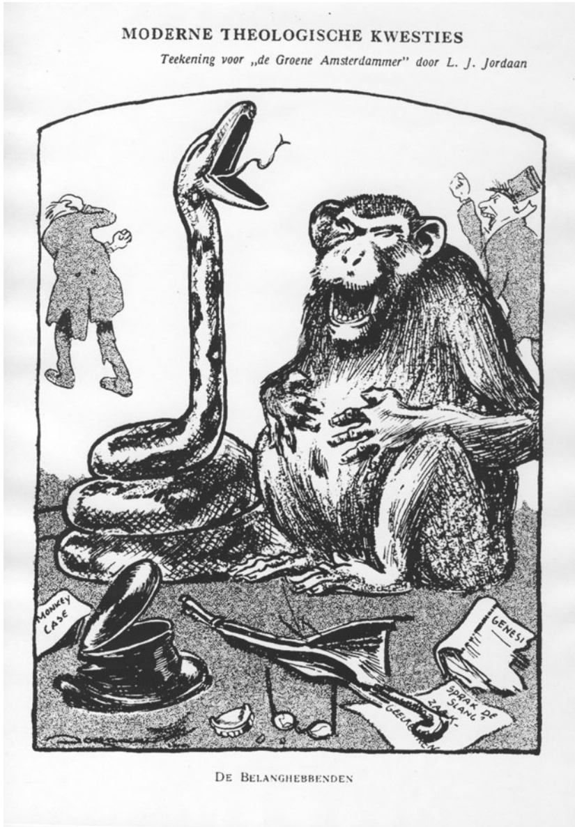
Fig. 3. Caricature comparing the Geelkerken Case in the Netherlands (“Did the serpent really speak?”) to the “Monkey Trial” in the USA: A serpent and an ape are portrayed as “the interested parties” in “modern theological issues.” (photo: De Groene Amsterdammer , September 19, 1925).