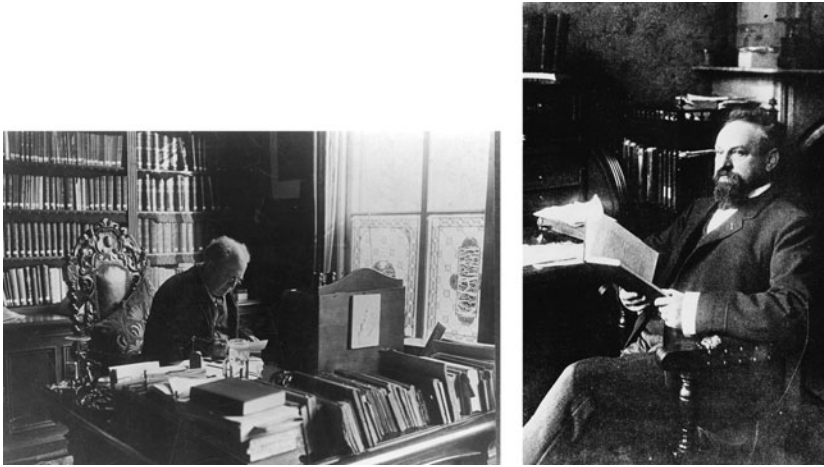
Fig. 1. Leaders of the Dutch neo-Calvinists around 1900: Abraham Kuyper (1837–1920) and Herman Bavinck (1854–1921); (photos: Historical Documentation Centre for Dutch Protestantism).

Beside this criticism on the level of worldview and presuppositions, there was the question of the factual discrepancy between the biblical creation story and the evolutionary account. The Dutch neo-Calvinists had always stressed—against the historical-critical approach of modern theologians—that Scripture is the infallible Word of God. This also implied that it accurately presented historical and natural facts. 27 This raises the question of how the Dutch Calvinists dealt with the results of geology and palaeontology, in which questions of worldview indeed appear to be less important, but certain results—the great antiquity of the Earth and of fossils—seem to contradict the Biblical account of creation. Nevertheless, in his Evolution address, Kuyper had stressed that “well-established facts can never be written off.” 28