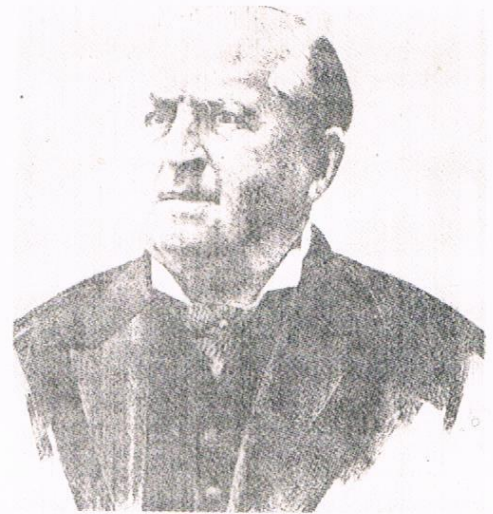
Dr. Abraham Kuyper (1837-1920), theologian and politician, was the driving force behind the Doleantie.

Everything was going well. It was a weekday and without being noticed the little group of inconspicuously dressed men entered the „Nieuwe Kerk” in Amsterdam. But how to enter the consistory room, which was as always securely locked? One of the intruders produced a small saw from under his jacket and proceeded to remove a few panels from the door. Now the conspirators crawled through the opening and occupied the room where in the course of the centuries so many preachers had spent the final minutes before addressing the Reformed faithful of the famous harbor city by “Het Y”.